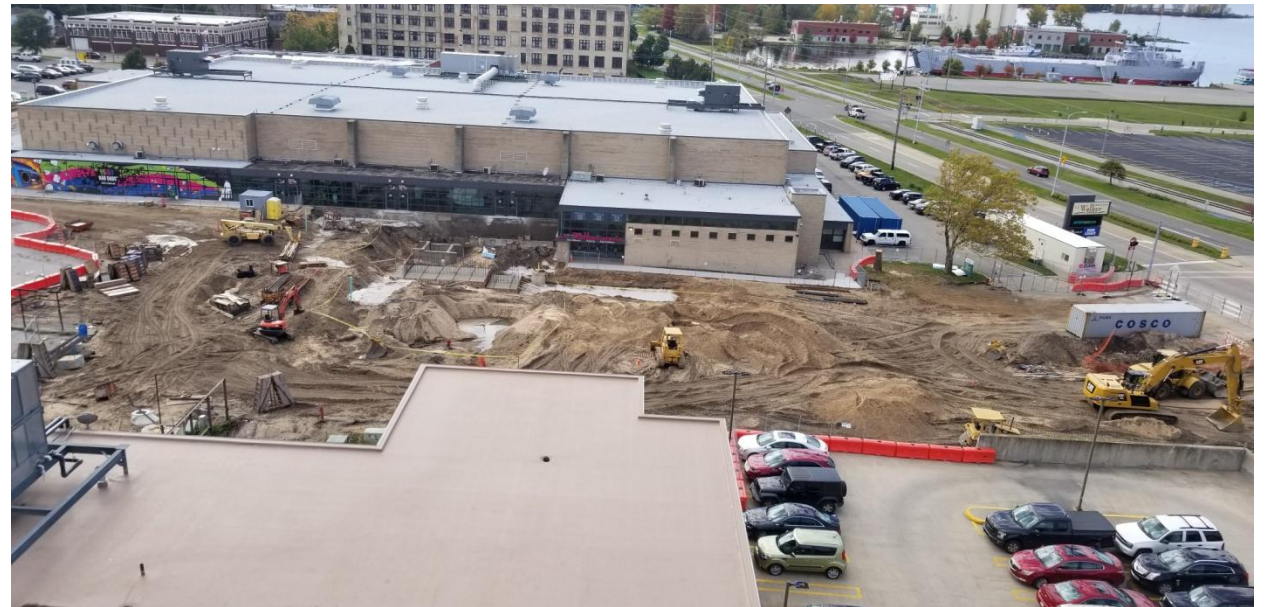
MUSKEGON CONFERENCE CENTER